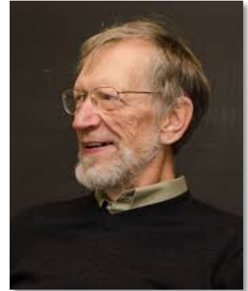
Al Plantinga (b. 1932)