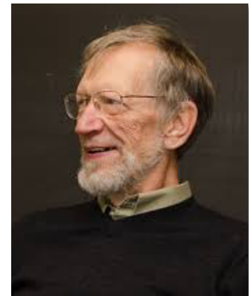
Al Plantinga (b. 1932)

Foundational beliefs must be basic (a “good reason to believe” that is non-inferential = “common-sensical”).