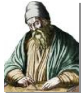
Euclid (c. 325-c.265 BCE)