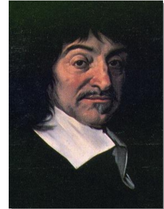
Rene Descartes (1596-1650)

Foundational beliefs must be absolutely certain, self-evident, incorrigible, “immune from error.”